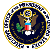
U.S. Trade Representative