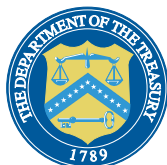
U.S. Department of the Treasury