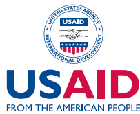
U.S. Agency for International Development