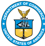
U.S. Department of Commerce