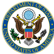
U.S. Department of State